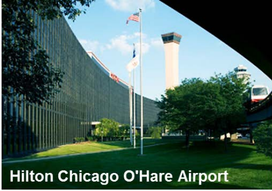
Hilton Chicago O'Hare Airport