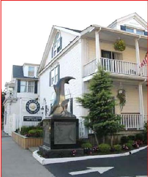
Danford's Hotel & Marina