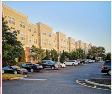
Residence Inn by Marriott