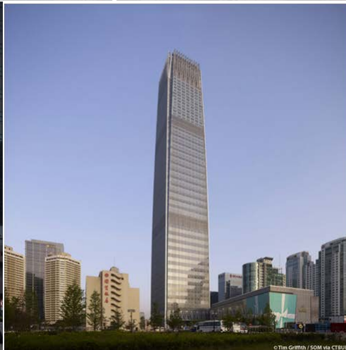
China World Trade Center Beijing