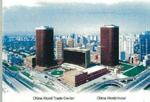
China World Trade Center