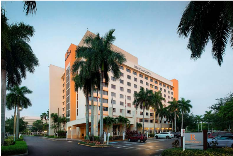
Renaissance Fort Lauderdale Plantation Hotel