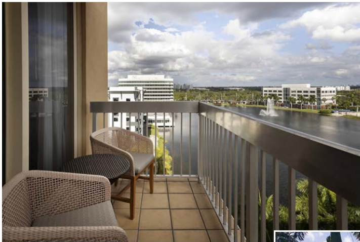
Renaissance Fort Lauderdale-Plantation Hotel