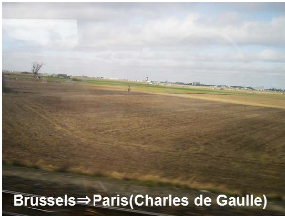
Brussels⇒Paris(Charles de Gaulle)